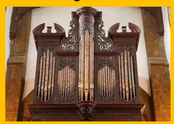
Wednesday 2nd July, I 0.30am