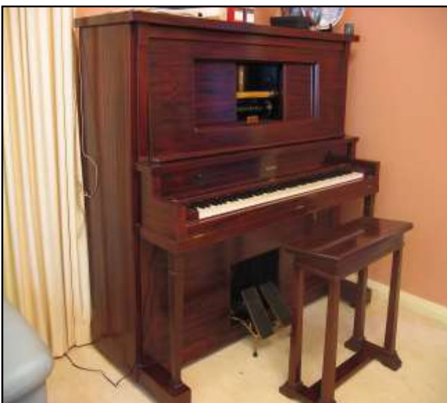
A pianola with player mechanism behind the music desk. The pedals are for pumping the player mechanism as with a harmonium.