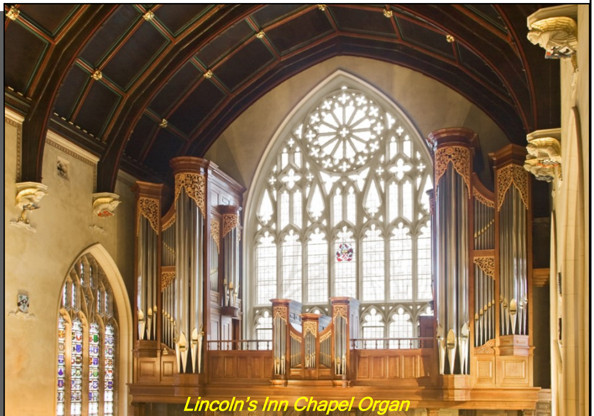
Lincoln's Inn Chapel Organ