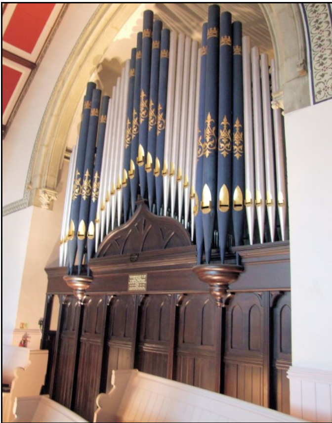
This conventional pipe-rack style case hides a remarkable secret: a walk-in windchest.

across the choir gallery, through a door at the far side, round three sides of the back of the organ, climbing over pipes, ducking under ladders, stepping over buckets of water (necessary for hydration purposes), round to the other side and through a small door into the chamber itself. The door was closed on us and our ears adjusted to the changing pressure and, as Lee played something not too loud, we could see the various bits of the mechanism above us moving accordingly and sounding like synchronised clapping - as though all four parts of a choir had been asked to clap their lines in rhythm rather than sing them. Michael had warned us that once we were inside with the door closed, it could not be opened again until the pressurised air was fully discharged (by switching off the blower and playing to let out any residual air). But we did get out, back over the obstacle course, to allow the next brave five to experience the phenomenon.