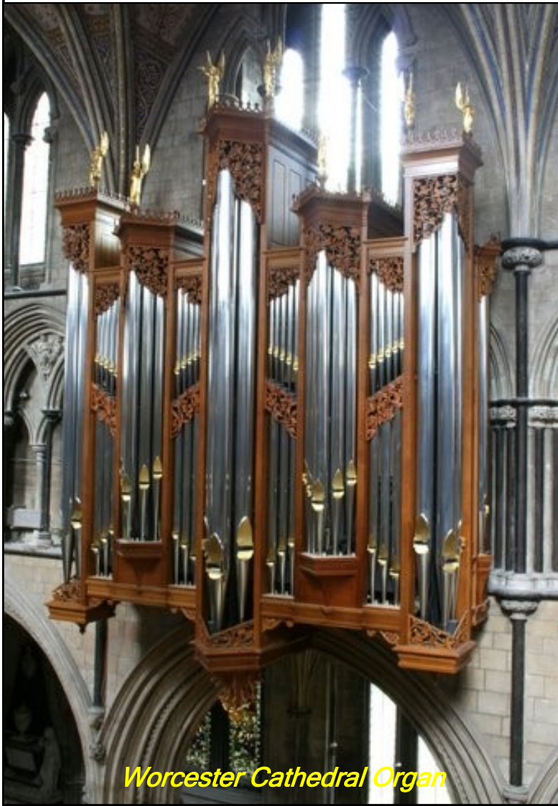
Worcester Cathedral Organ