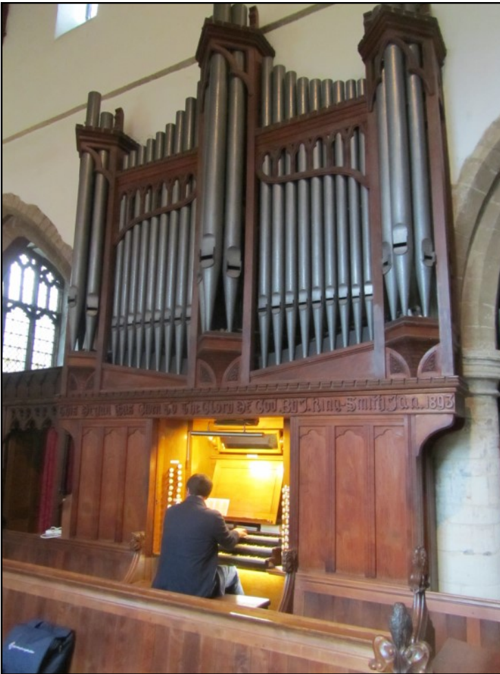
The three manual Conacher organ at St. Peter's Church, Raunds.